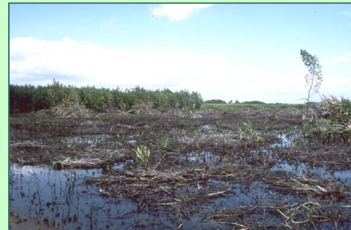
Mangroves at Salo

XV Katoomba Meeting La Palm Hotel Accra, 6 – 7 th October 2009