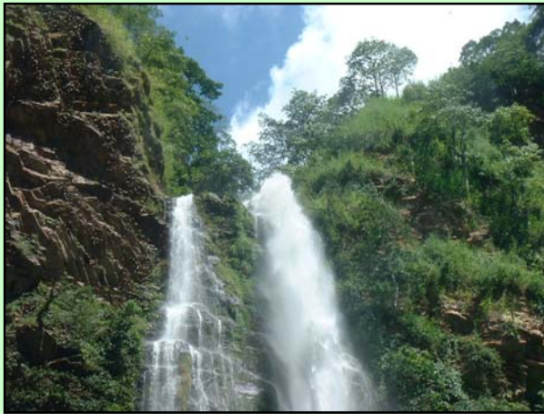
Wli Water falls